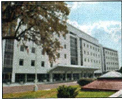
Malcom Randall VA Medical Center